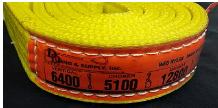
Synthetic Sling ID Tag System